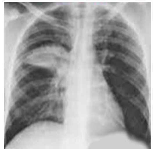
2-rasm. Xlamidiyali pnevmoniya.