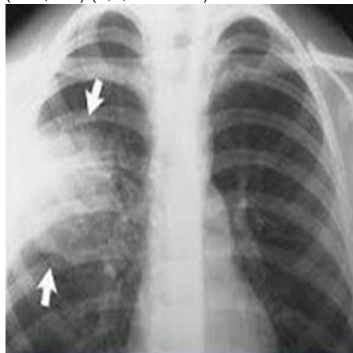
1-rasm. Pnevmonokokkli pnevmoniya.

Natijalar va muxokama. Retrospektiv tahlil natijalari kasallikning klinik kechishi bo'yicha bakterial, atipik bakterial va virusli pnevmoniyalar klinik simptomlarining (yotal, isitma, entikish) ko'pincha bir xil bo'lishini (100,0%; 86,0%; 88,0%) va shuning uchun ham turli xil etiologiyali pnevmoniyalarni ishonchli tarzda ajratib bo'lmasligini tasdiqladi ( P < 0,001 ) (1,2,3 rasmlar).