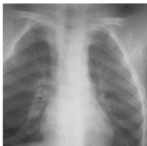
5-rasm. Mikoplazmali nevmoniya.

Ta'kidlash joizki, o'pka ultratovush tekshiruvini plevral suyuqliklar va empiemani aniqlash uchun asosiy tashxis vositasi sifatida qollaniladi [6]. Bizning tekshiruvlarimizda virusli va bakterial pnevmoniyaning farqlashda asosan klinik va laboratoriya parametrlaridan foydalanilgan.