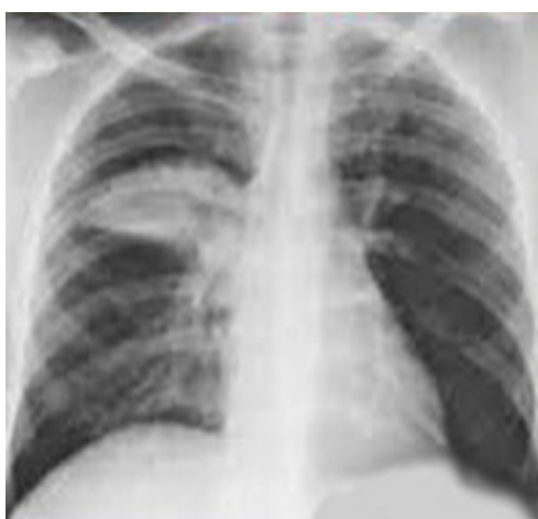
4-rasm. Stafilokokkli pnevmoniya.

Bizning tekshiruvimizda lobar va segmentar shikastlanishlar asosan bakterial etiologiyali (55,0%), interstitsial infiltratlar, peribronxial qalinlashuvlar esa asosan virusli (65,0%) va mikoplazmali (57,0%) pnevmoniyada aniqlandi ( P < 0,001-0,01 ) (4,5,6 rasmlar).